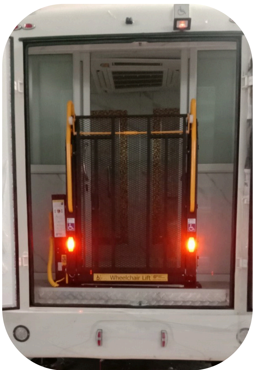
Full Rigid Platform